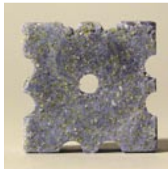
Havoc-XT Blok shown actual size